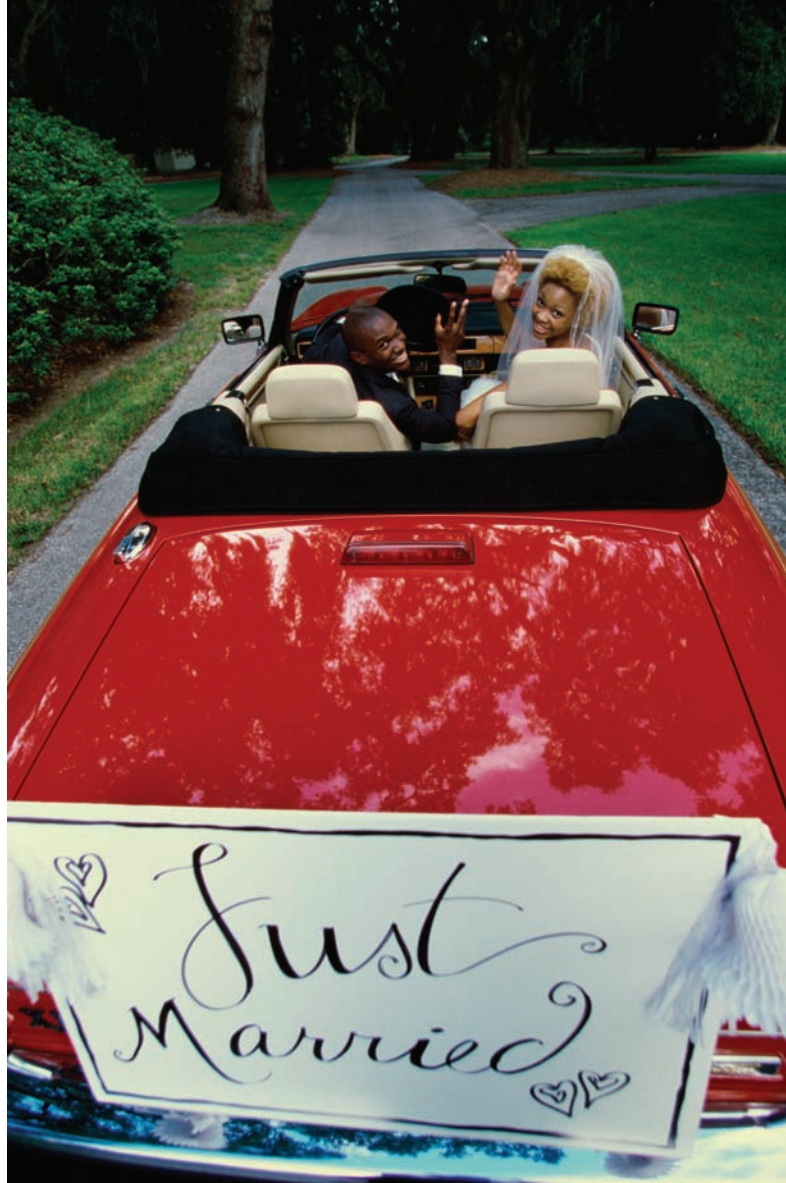
Life events such as marriage, birth, and death affect demographic changes.

to consider what the facts mean in terms of our customer base. The material in this section is vital to understanding the most basic force driving the hospitality industry's development, which is demand—that is, customers.