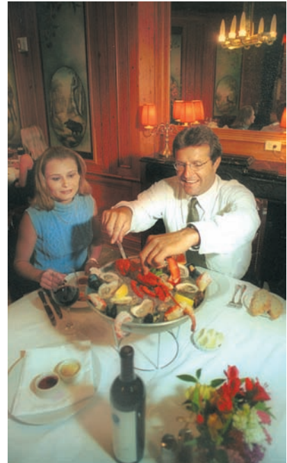
Couples without children are a growing segment of the population.

Also remember that households in the upper-income groups frequently represent dual-income families where both spouses are working. These families experience great time pressure, which undoubtedly explains the rapid growth in sales in both take-out and the upscale casual category, a haven offering a quick moment of fun and relaxation to these busy people.